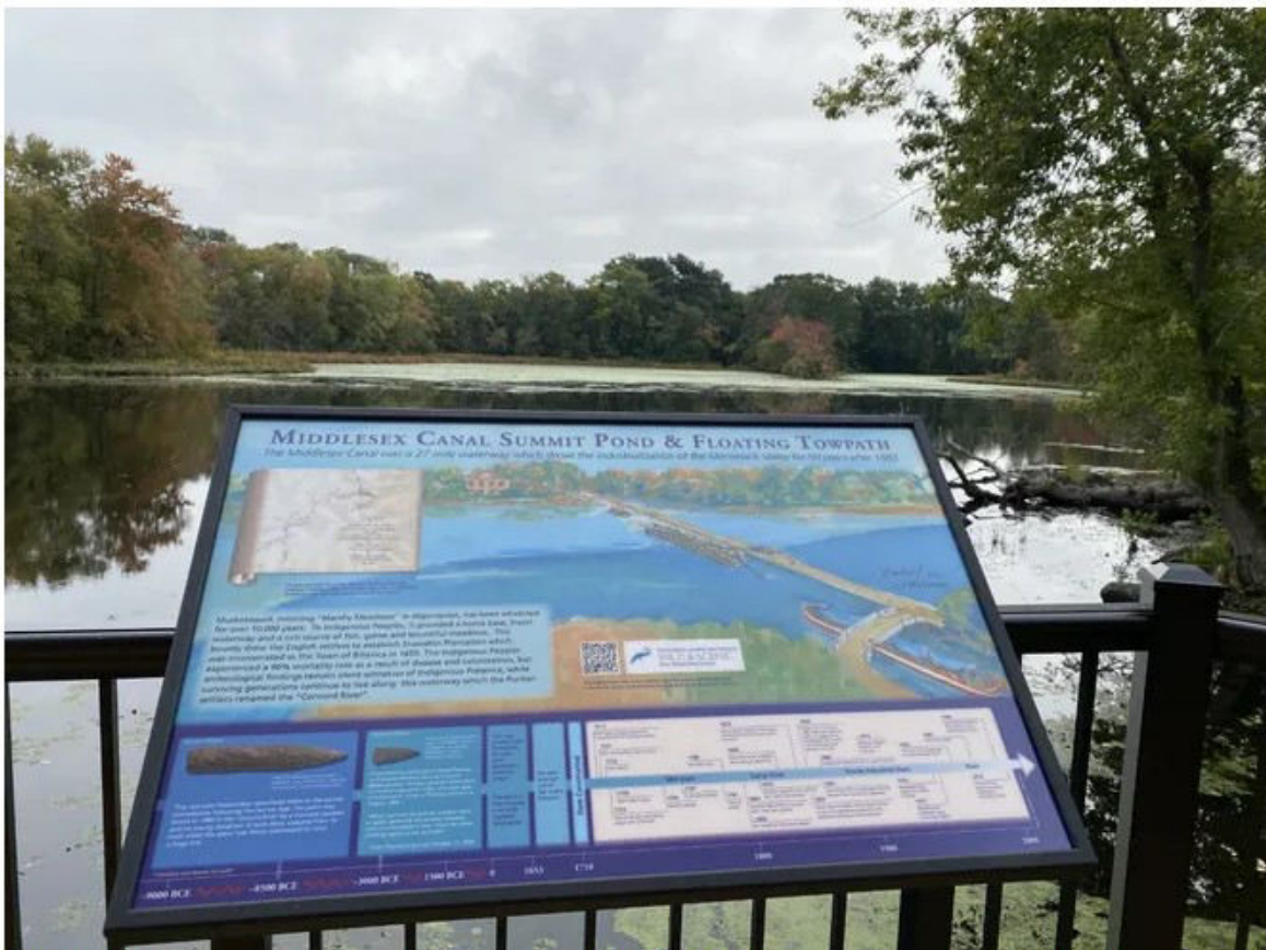
An interpretive sign panel was unveiled on Sunday, Oct. 3, at the future Middlesex Canal museum in North Billerica.

The new deck and sign are part of a larger project to restore the former warehouse at 2 Old Elm St. in the North Billerica Historic Mill District and rehabilitate it as the new Middlesex Canal Museum and Visitor Center.