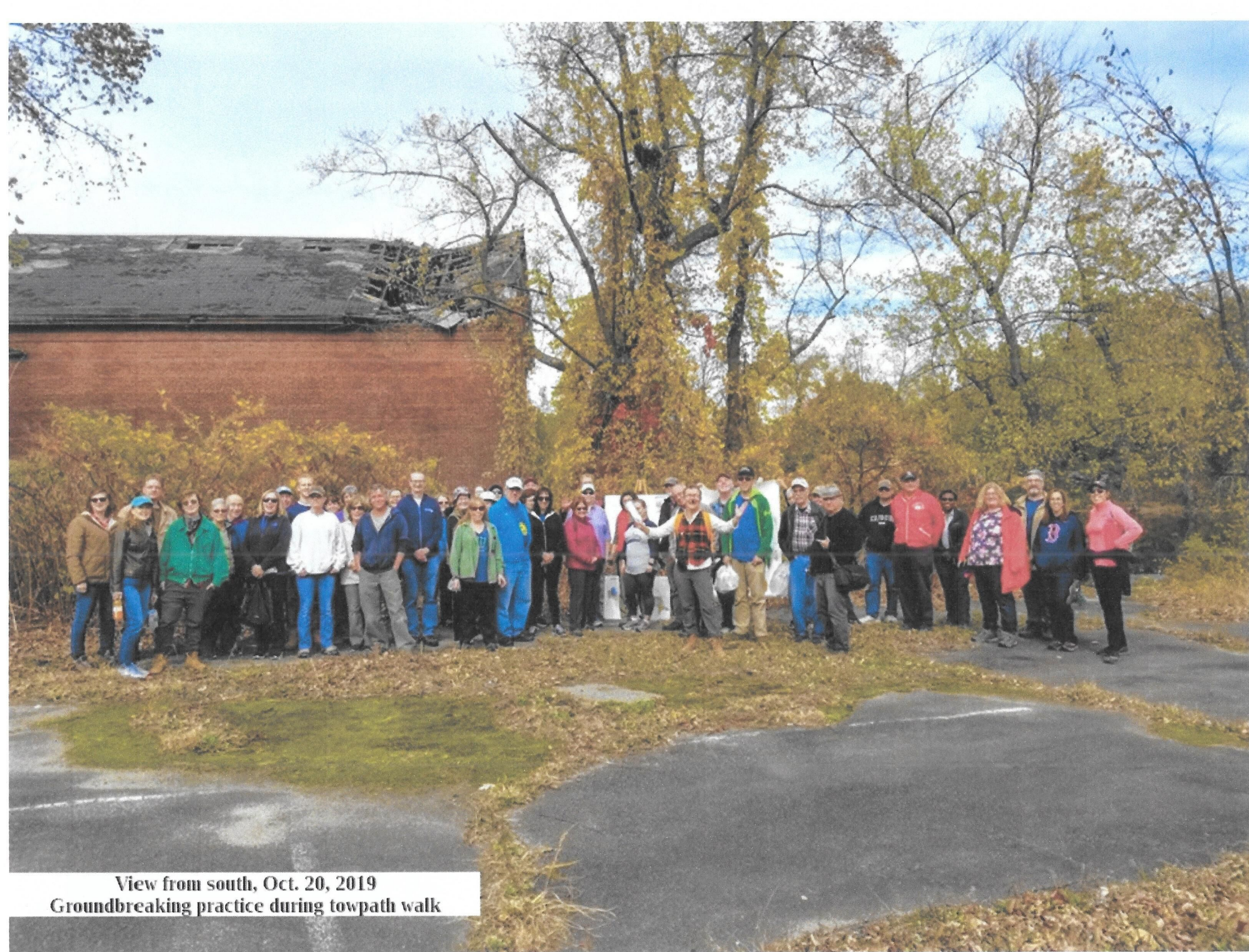
View from south, Oct. 20, 2019 Groundbreaking practice during towpath walk