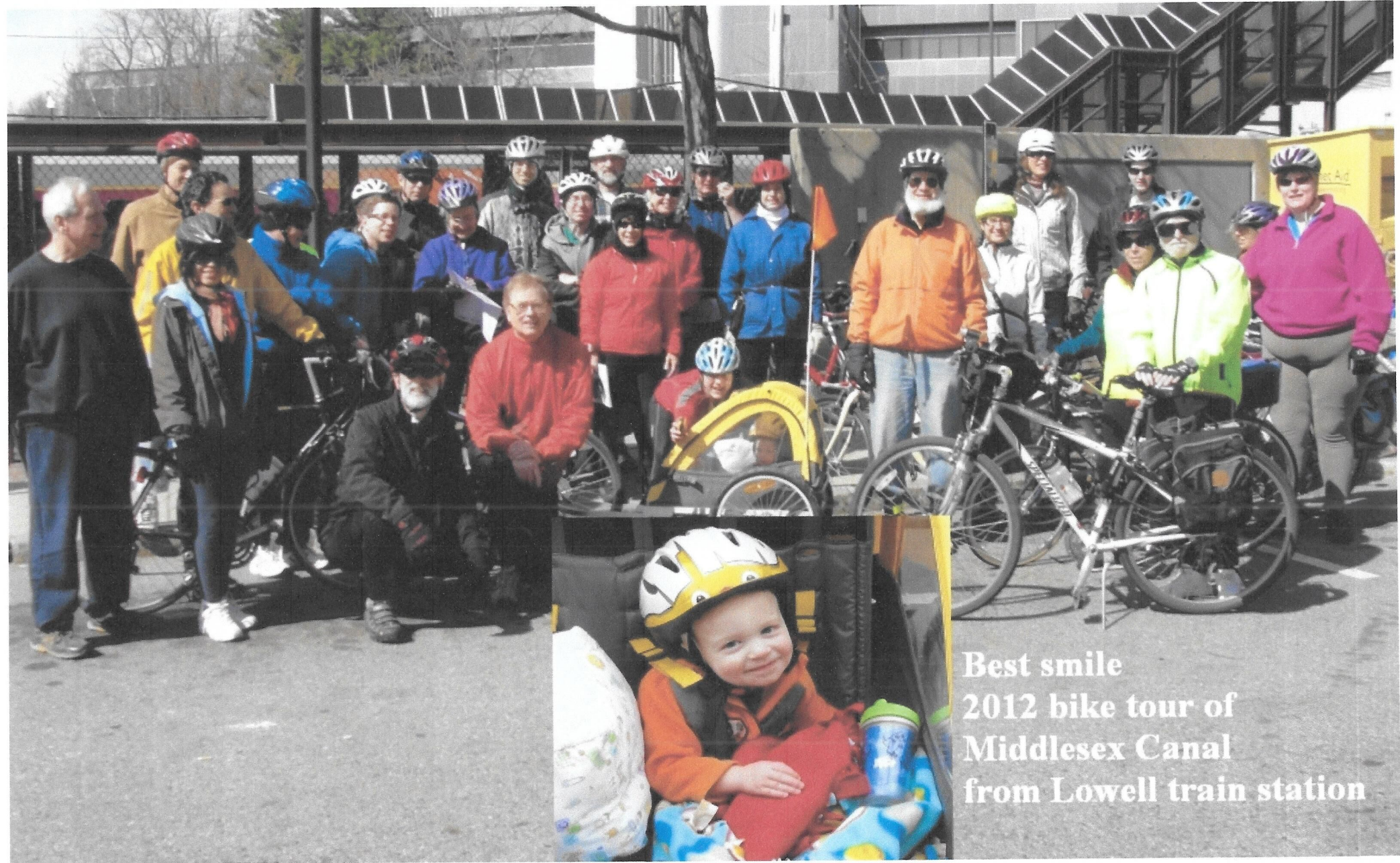
Best smile 2012 bike tour of Middlesex Canal from Lowell train station