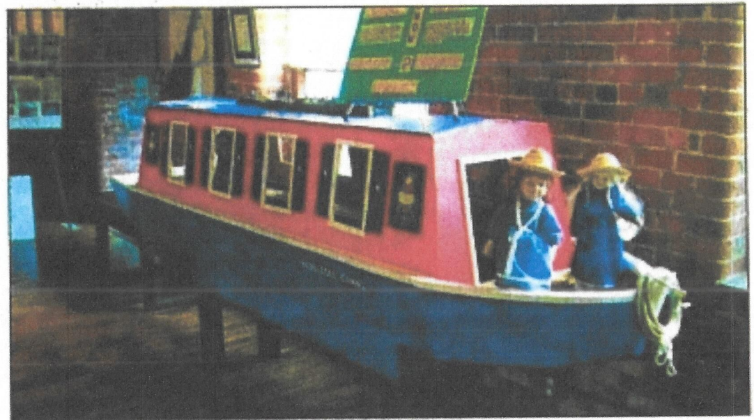
A canal boat model on display at the Middlesex Canal Museum and Visitor Center in Billerica. The museum plans to move to the 1880s Talbot cloth warehouse.