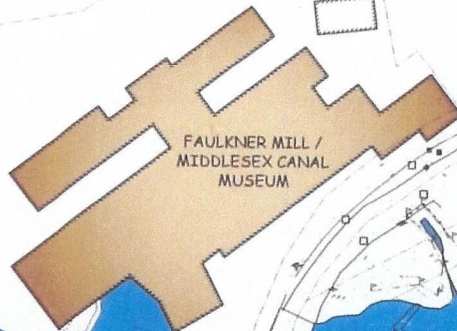
FAULKNER MILL / MIDDLESEX CANAL MUSEUM