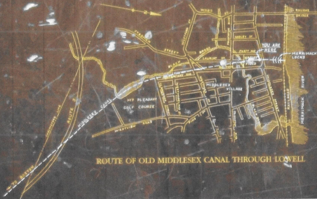
ROUTE OF OLD MIDDLESEX CANAL THROUGH LOWELL

The canal was just over 27 miles long. It was 20 ft. wide at the bottom, 30½ ft. wide at the surface, and 3½ ft. deep. There were 20 locks, 8 aqueducts, and 50 bridges.