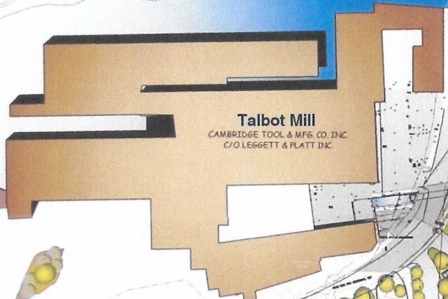
Talbot Mill CAMBRIDGE TOOL & MFG. CO. INC. C/O LEGGETT & PLATT INC.

warehouse, 40' x 60' 40' ground to roof peak