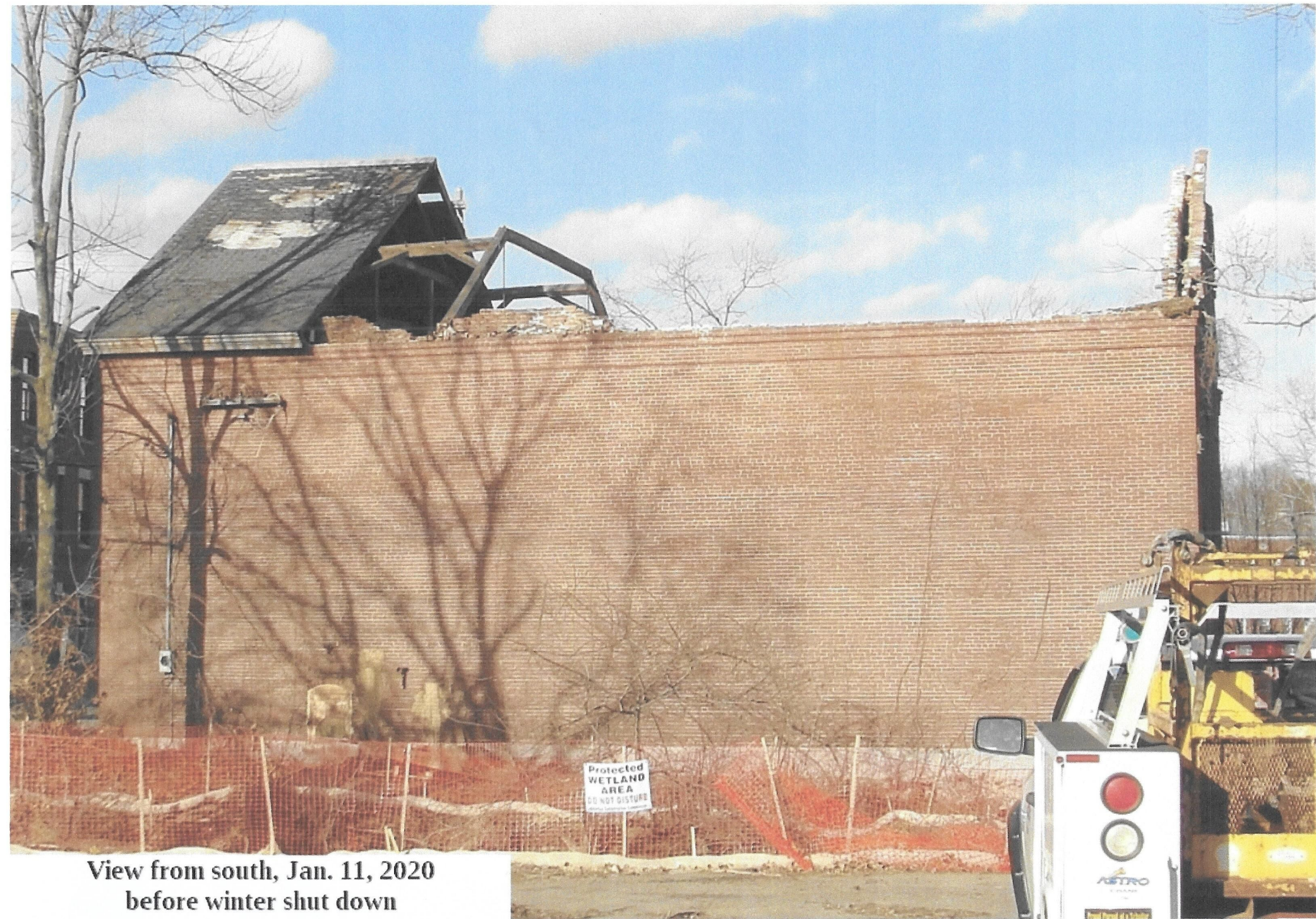
View from south, Jan. 11, 2020 before winter shut down