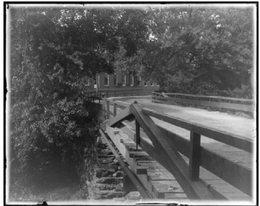
Wooden bridge deck from the downriver side in circa 1908