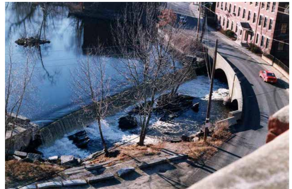
Picture of the cement bridge built in 1910. The photograph was taken from the top of the Faulkner Mill tower by the author in 1998.

NB: MassDot inspected the bridge in the picture on September 25, 2019. Selected statistic from the inspection are contained in the following list.