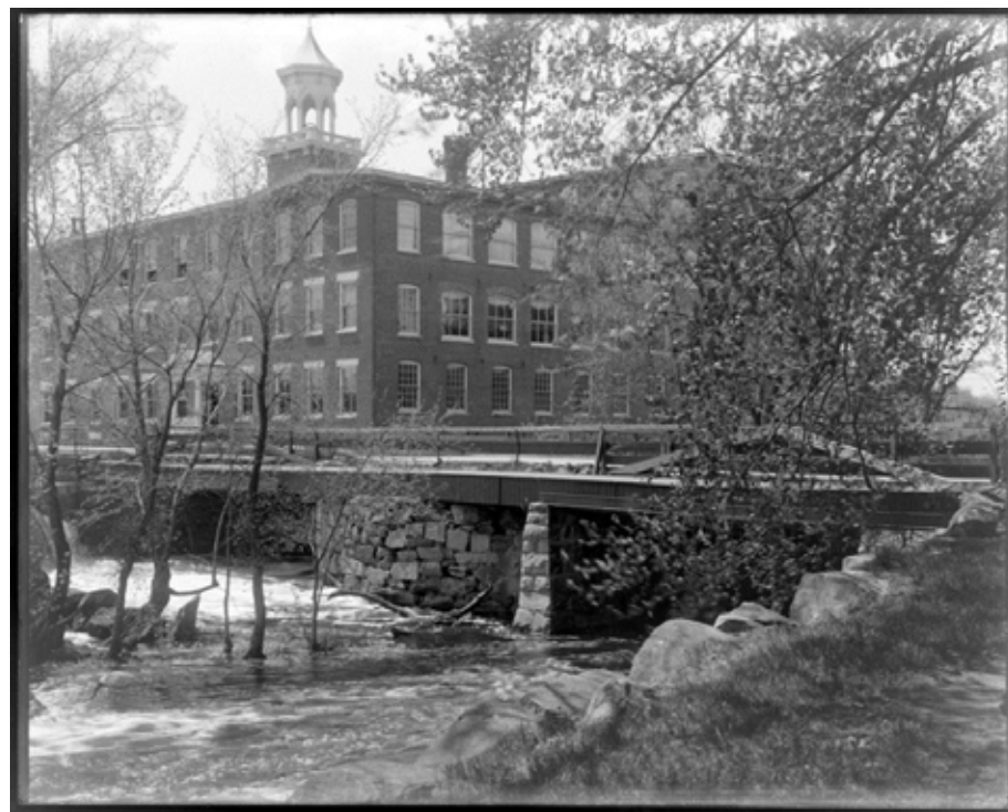
The Faulkner Street Bridge pictured in 1908.

The bridge had two heavy wooden trusses one extending from the west bank of the river to a pier of granite blocks about a third of the way across the river,