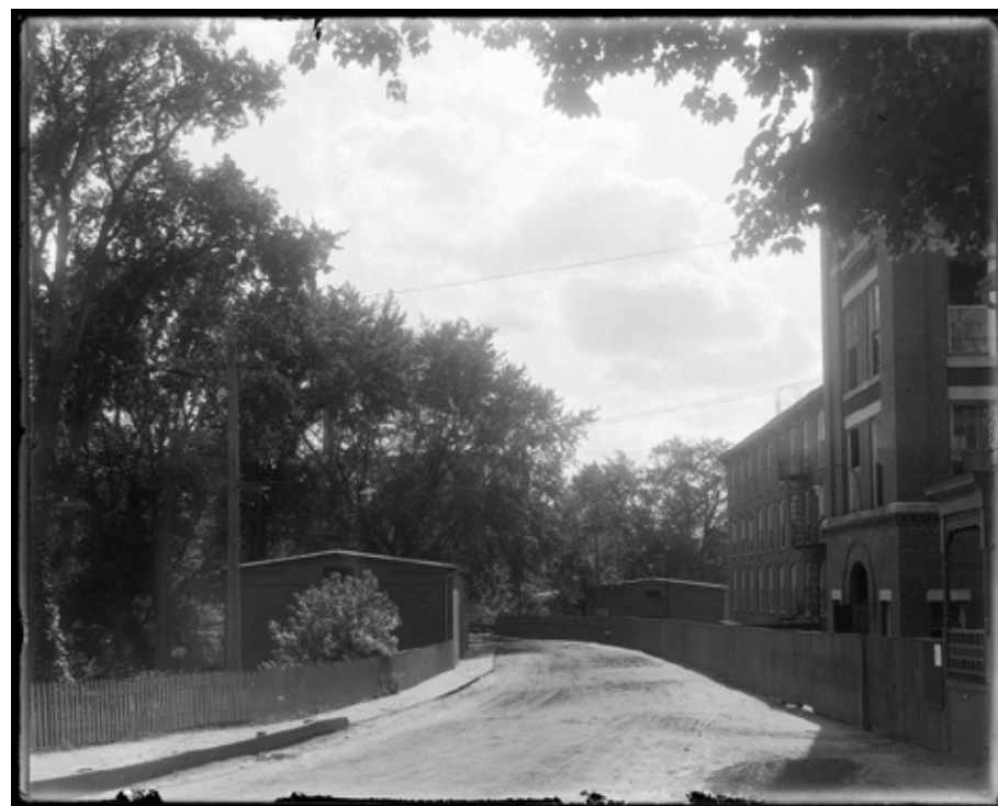
The Faulkner Manufacturing Company storehouse opposite the main mill complex which was removed when the new concrete bridge was built in 1910.

A special Town Meeting was called on August 2, 1910. The Committee's