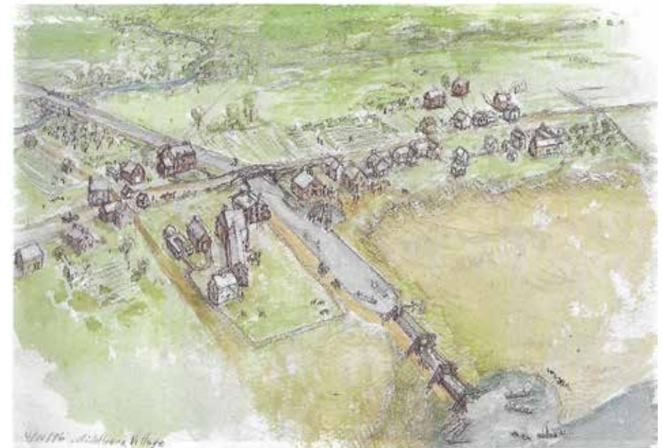
Middlesex Village, Dahill, 1996, from an 1829 survey. The village developed after the canal opened in 1803. Boats traveling between Boston and Concord NH used the three lock staircase to move between the canal and the Merrimack River, 24' lower.