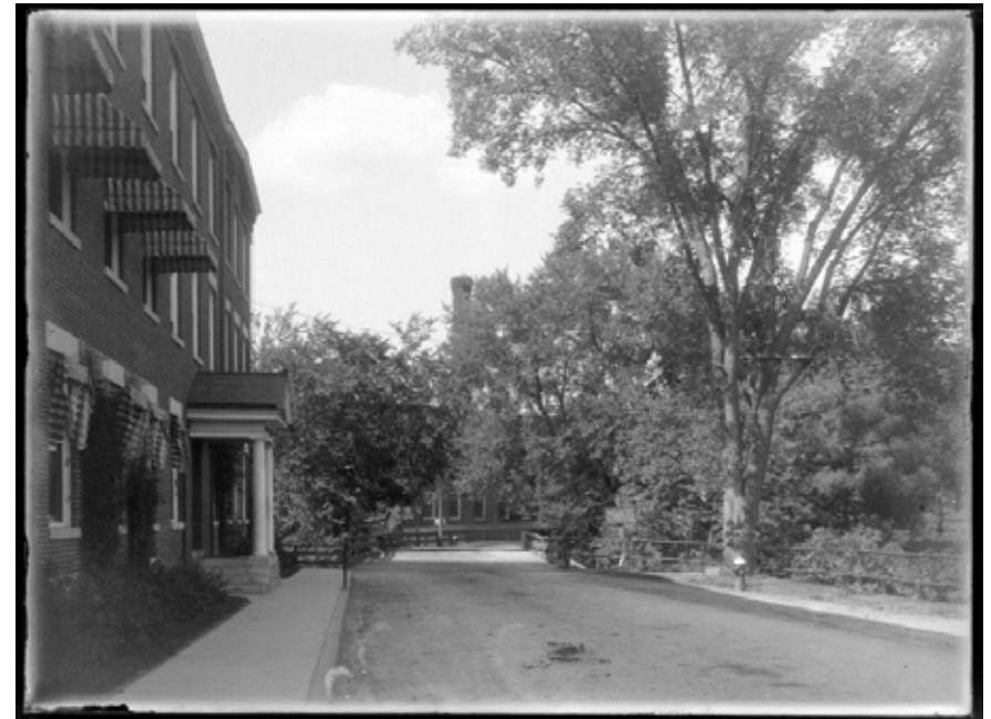
Approach to the bridge from the Talbot Mill side (West Bank) 1908