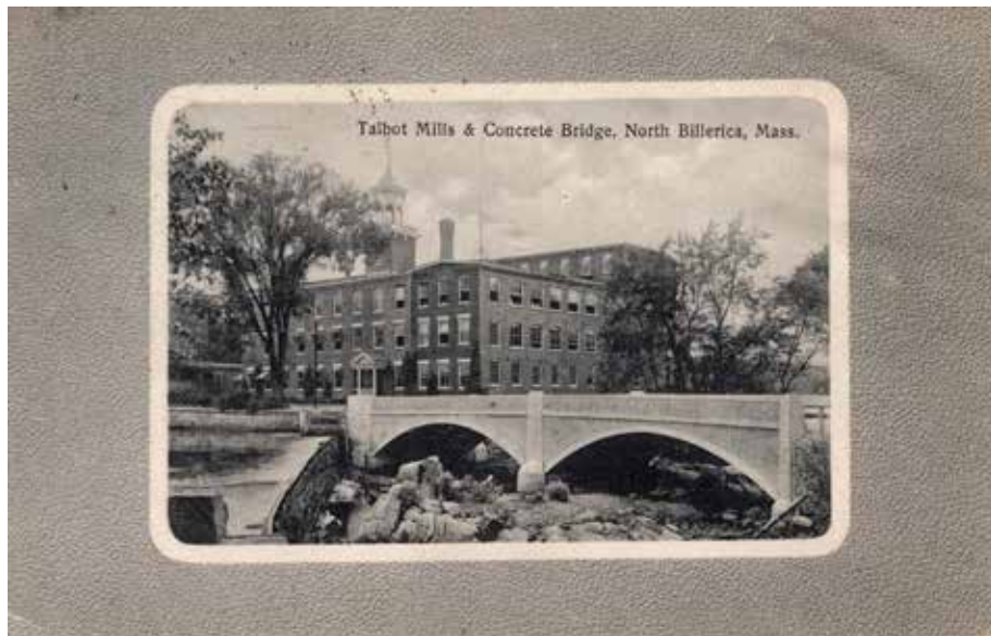
1910 Cement Bridge