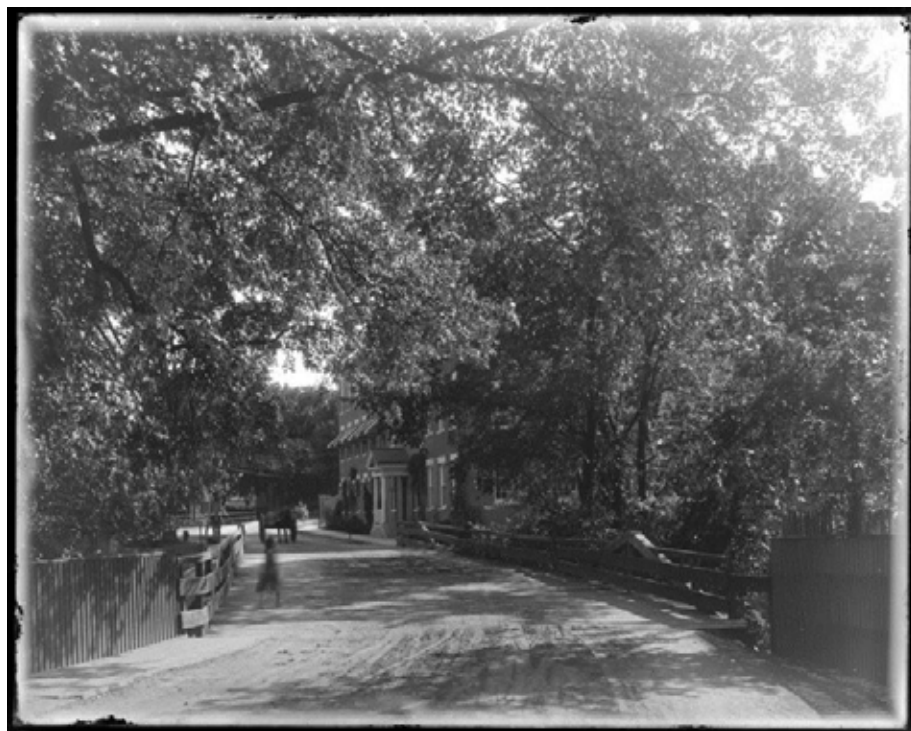
Approach to the bridge from the Faulkner Mill Side in 1908