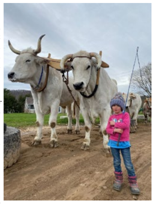
A yolk of oxen pictured with a young child.

The Massachusetts Cultural Council has granted the Association $1,500 for tow animals, a petting zoo?, to be part