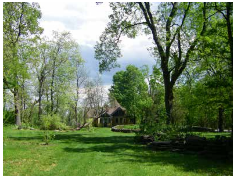
Holdenwood and Maplewood Manor