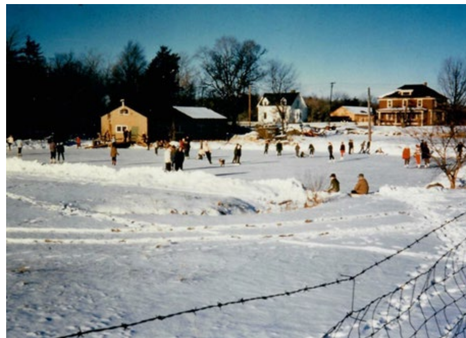
Photographs of the Potter Pond on a snowy day about 1960, showing in one Alec Ingraham’s brother Allan, standing in front of the sign. The family barn, heated by wood with an old iron stove, is where skaters paid and put on their skates.

One of the farm’s special features was its attractive pond, which the Potters turned in the 1950s, during the winter months into a skating rink. Ingraham’s sharp memory makes it alive again. “Stuart erected light poles to permit skating at night. It was quite a sight on a weekend evening to see the skaters from the window in our living room. My brother and I could not wait until it was cold enough for the pond to open in the winter. Generally, we skated at Potter’s from Christmas until February Vacation. I