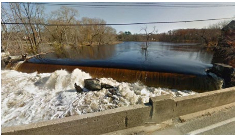
Concord River, Billerica Falls Dam, and Thoreau

And indeed, for the past five years, inmates from the Middlesex Sheriff Community Work Program (CWP) have made maintenance of this historic trail their regular business. This fall we celebrate the fifth anniversary of a fruitful partnership: Middlesex inmates get used to being ‘outside’, while preparing Middlesex Canal trails – for the community to get outside!