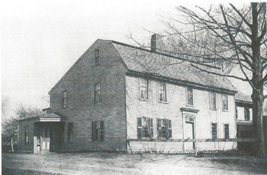
The Samuel Tay Homestead once located at the corner of East Nichols and Main Streets.